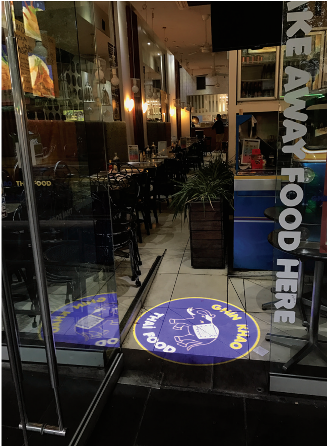
Grand Lighting GL40 Gen II with 'Ghin Khao' Full Colour Glass Gobo