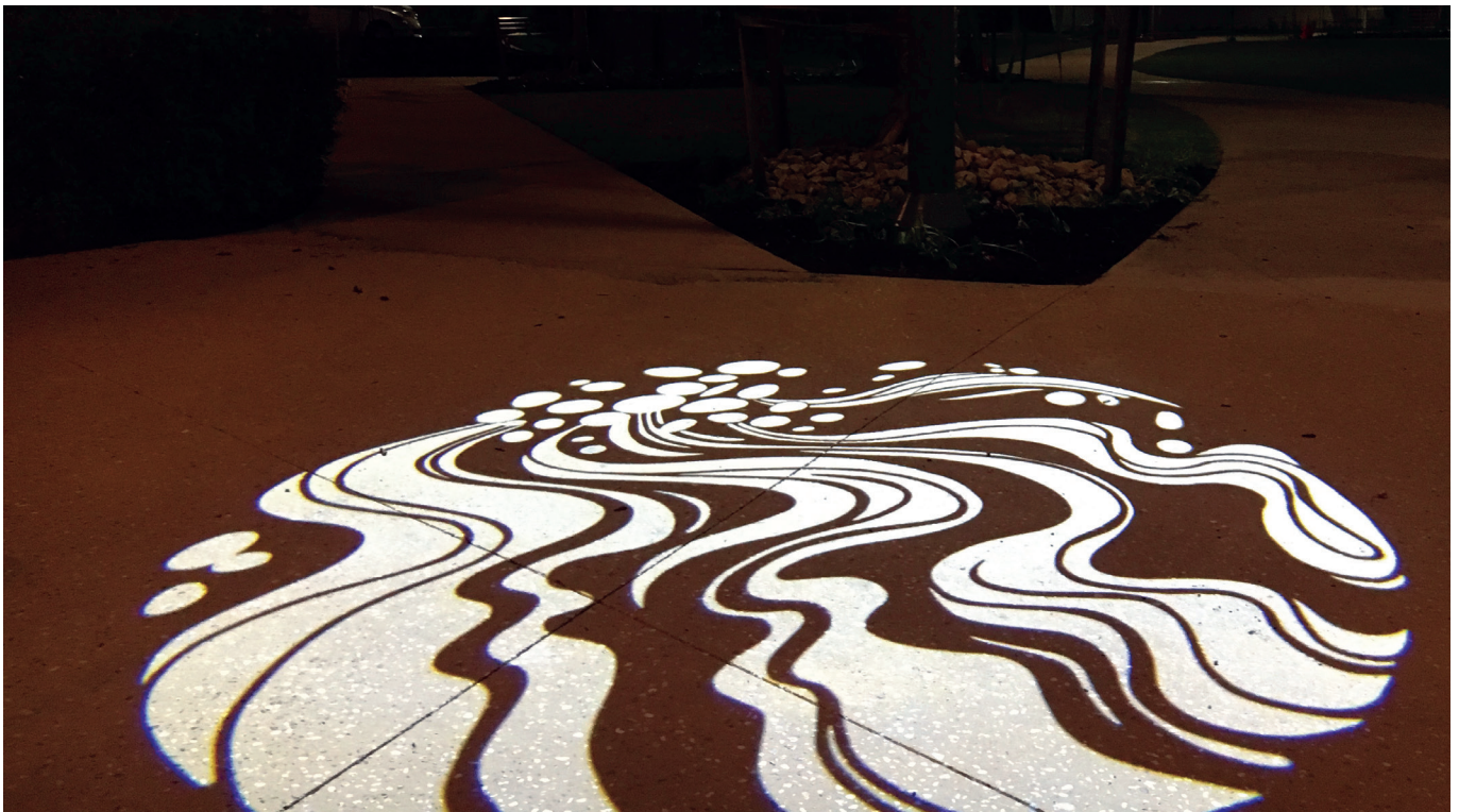
Grand Lighting GL40 Gen II with B&W Glass Gobo