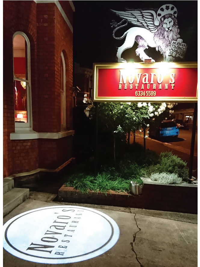
Grand Lighting GL40 Gen II with 'Novaro's Restaurant' B&W Glass Gobo