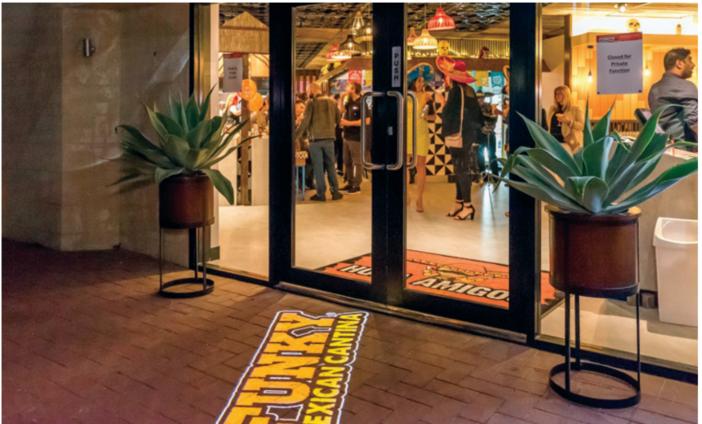
Grand Lighting GL30 - Full Colour Glass Gobo