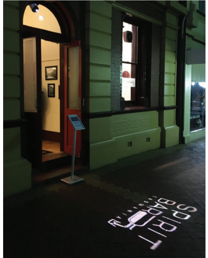
Grand Lighting GL30 - B&W Glass Gobo