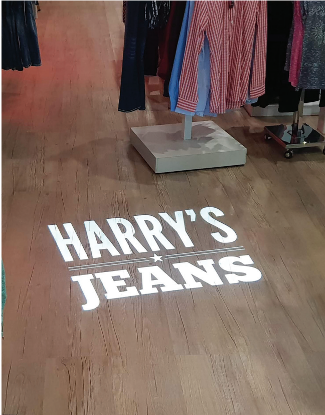
Grand Lighting GL30 - B&W Glass Gobo